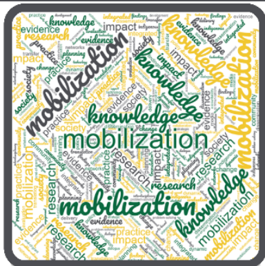
Knowledge Mobilization Resource Guide