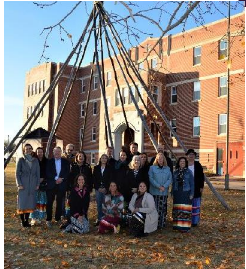
Indigenous Leadership Circle in Research with tri-agency staff, October 2022, at University nuhelot'jne thaiyots'j nistameyimâkanak Blue Quills